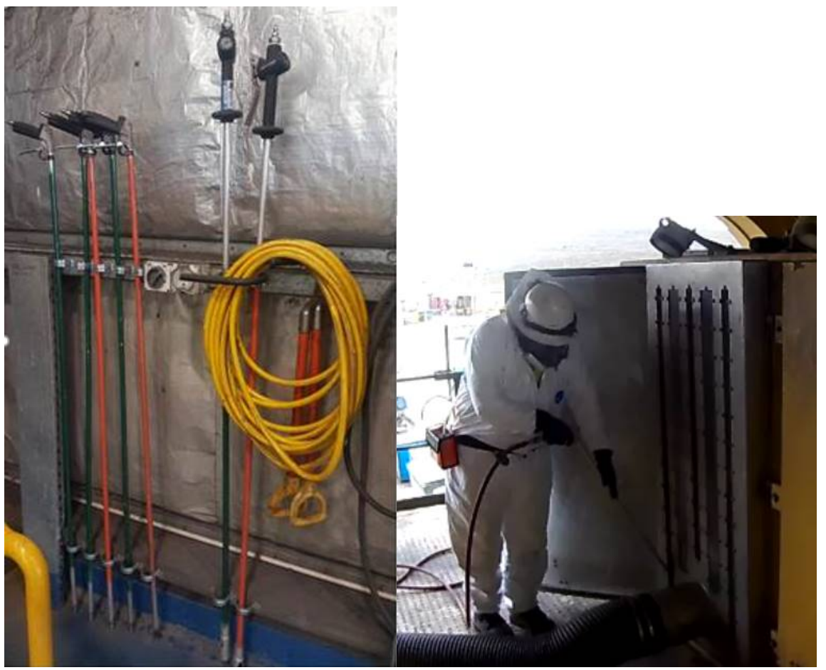
Figures18 & 19. The utilisation of extended air lances