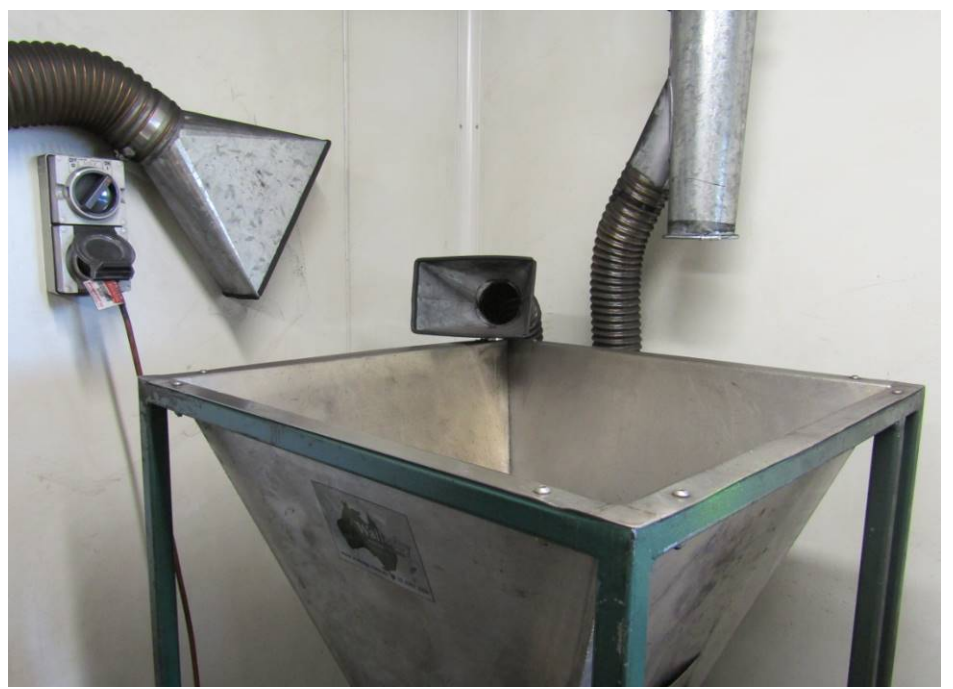
Figure 5. Example of movable and adjustable LEV's in a coal laboratory to account for dust sources (LEV's held in position by magnets)