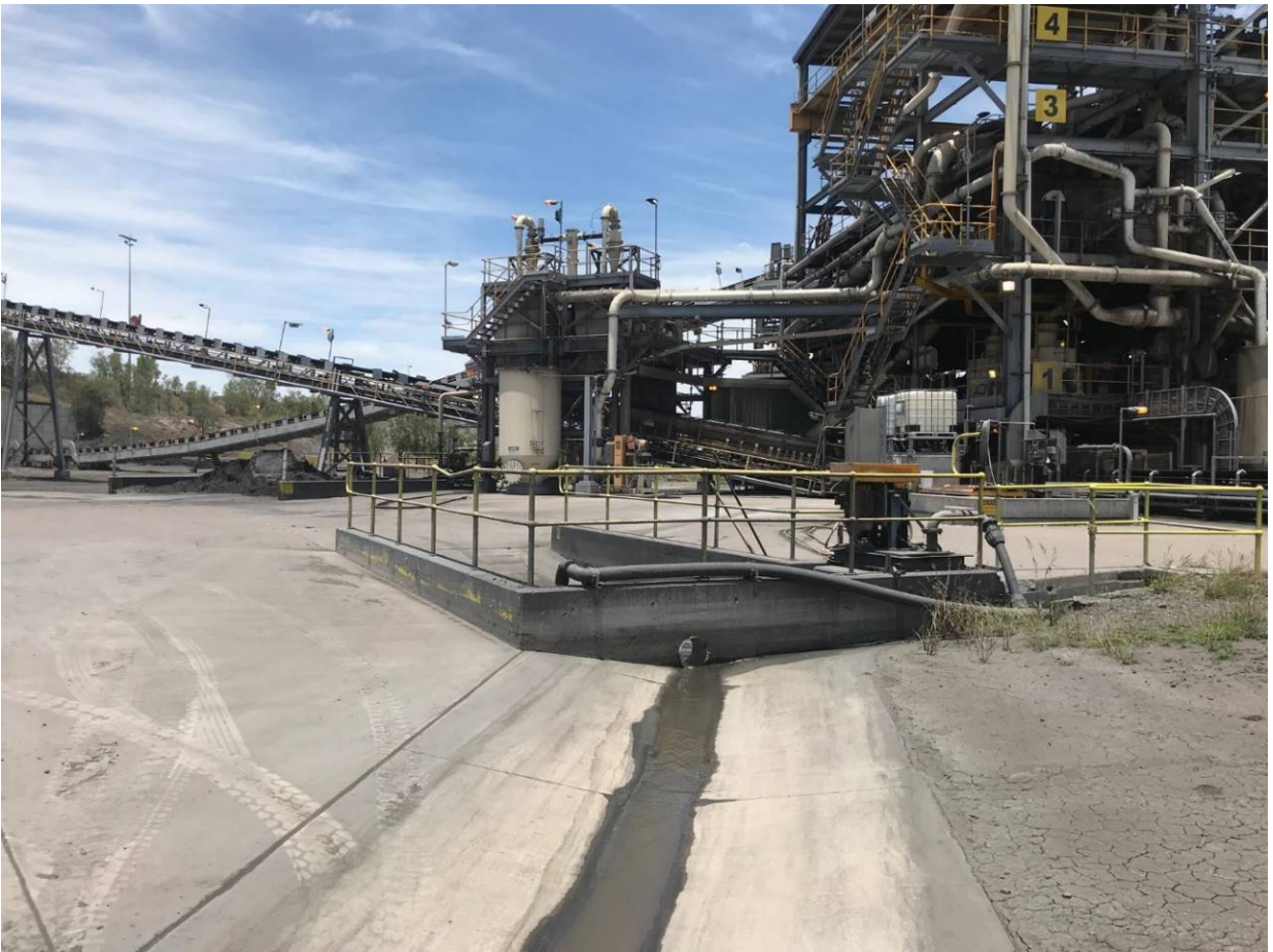
Figure 1. Concrete aprons below and around CHPP with drainage leading to sumps