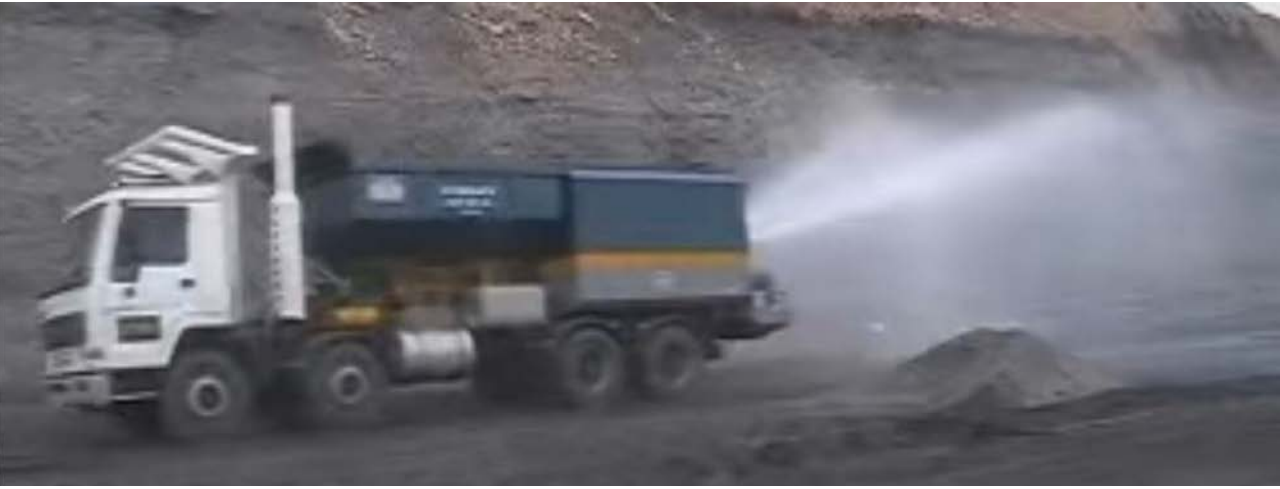
Figure 13. Watering shot bench down to suppress surface dust