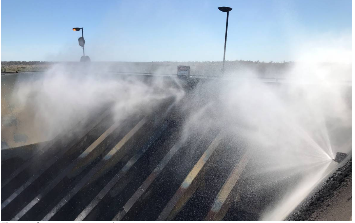
Figure 2. Sprays on dump stations