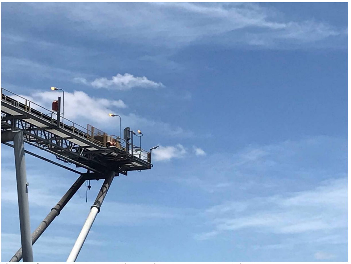
Figure 3. Cannon on conveyor delivery points to suppress stockpile dust