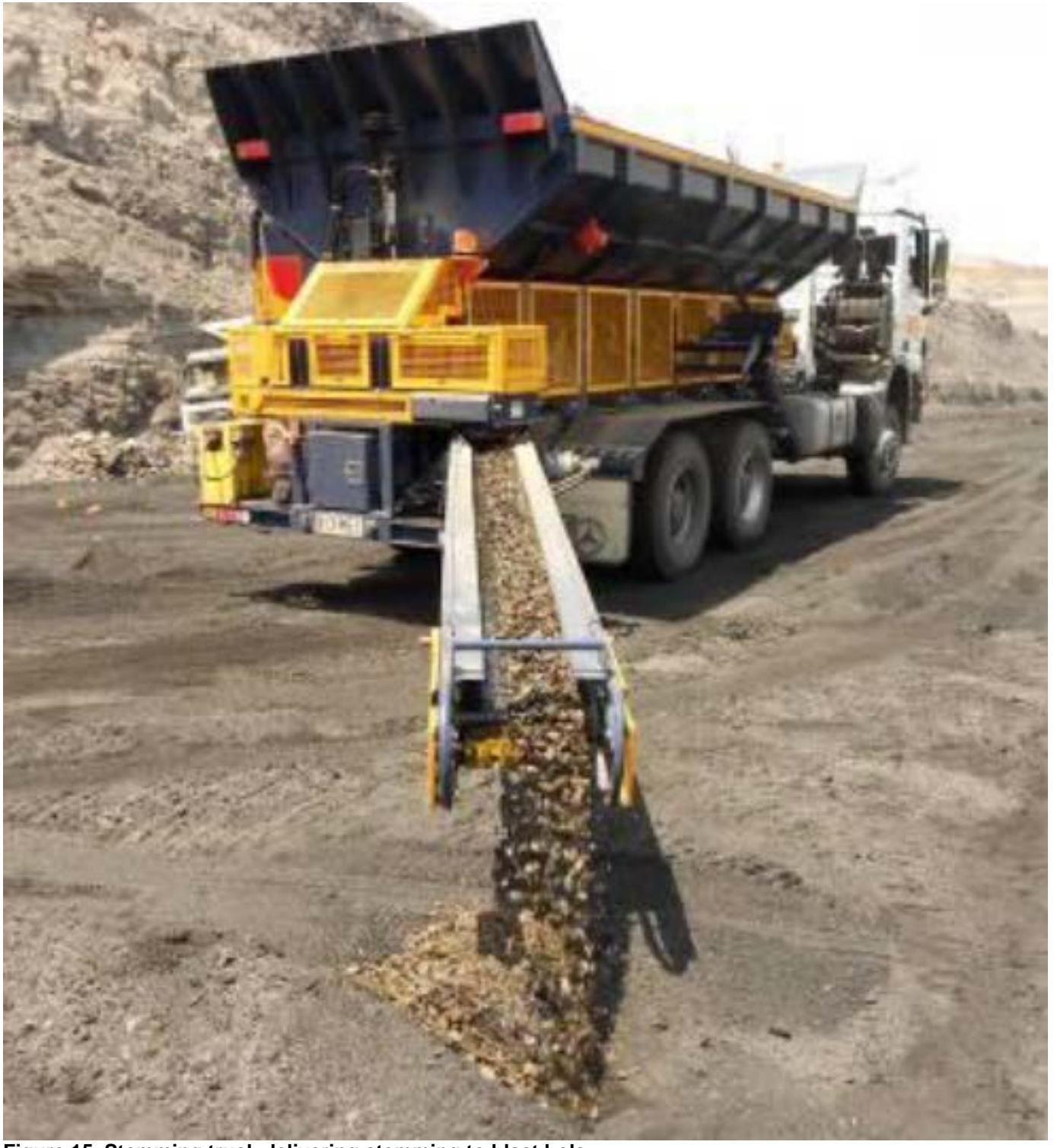
Figure 15. Stemming truck delivering stemming to blast hole