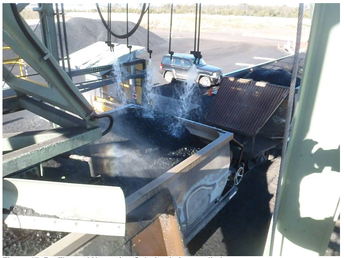
Figure 17. Profiler and Veneering Solution being applied