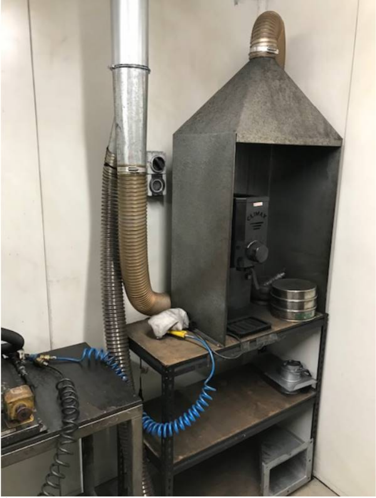
Figure 7. Example of a fixed LEV system in a coal laboratory