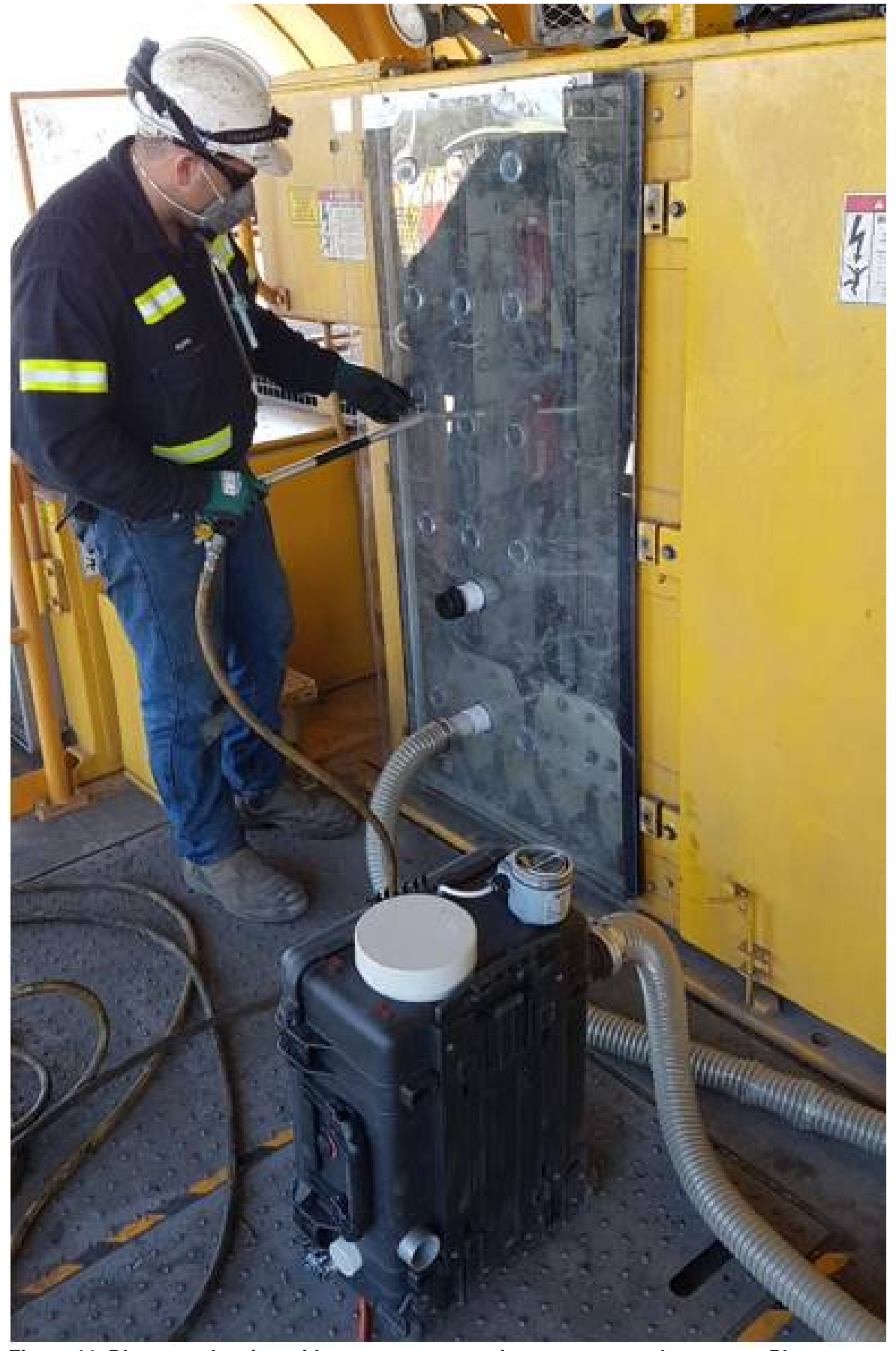
Figure 11. Blow-out cleaning with a prototype containment cover and prototype Plev