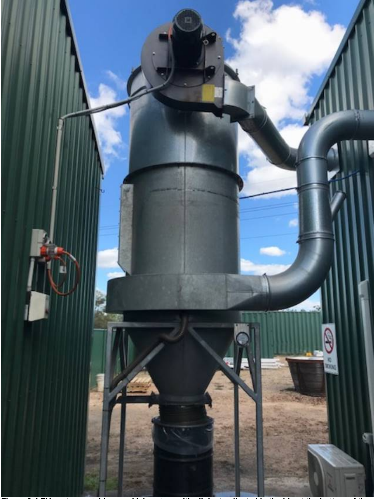
Figure 8. LEV system outside a coal laboratory with all dust collected in the bin at the bottom of the system