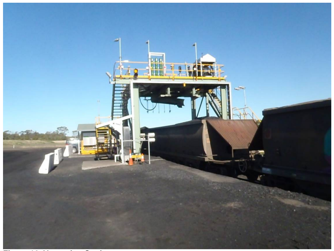
Figure 16. Veneering Station