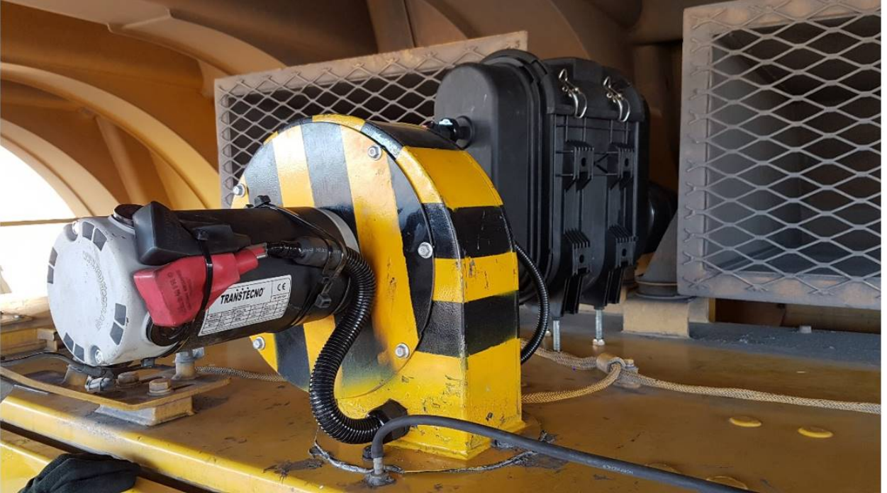
Figure 10. Pressurisation fan on top of cabinet, and the inlet filter can be seen behind the fan.