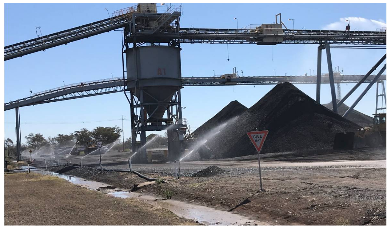
Figure 12. Sprinklers suppressing dust on roadways