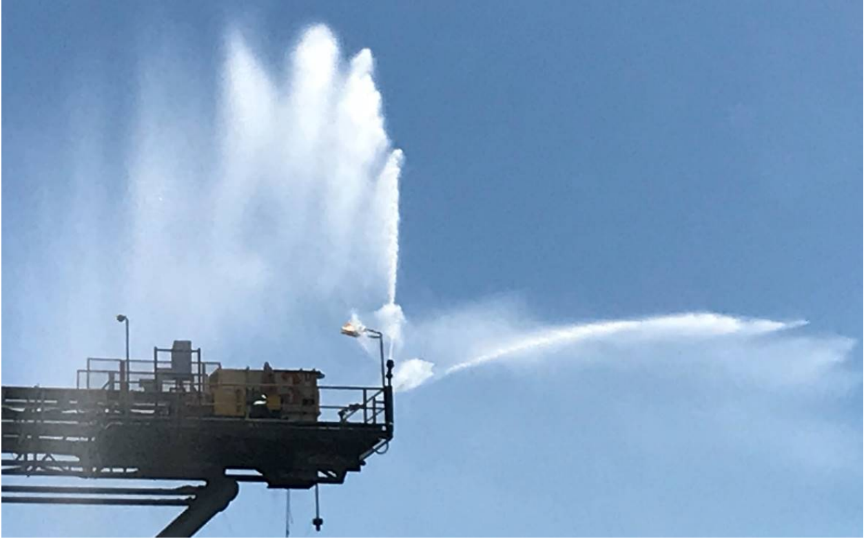
Figure 4. Cannons on conveyor delivery points to suppress stockpile dust