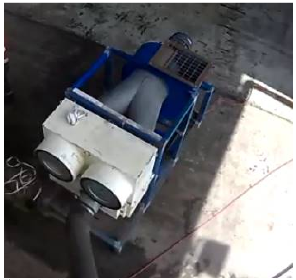
Figure 9. Portable extraction unit