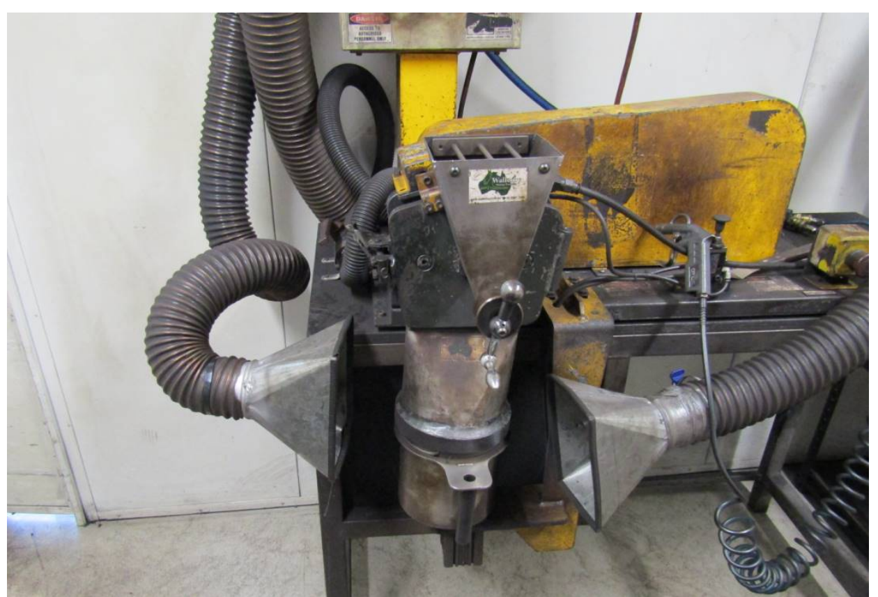
Figure 6. Example of a LEV system in a coal laboratory. Movable and adjustable LEV's to account for dust sources (LEV's held in position by magnets)