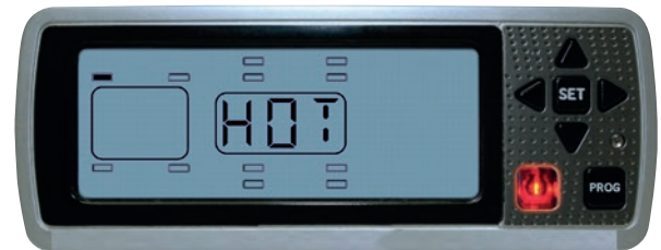
HIGH TEMPERATURE ALARM