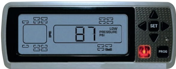
LOW PRESSURE ALARM

Tyre pressure and temperature data can also be accessed from the One-Click™ trailer transceiver using the LSM TyreGuard® SmartLink™ multi-function tablet.