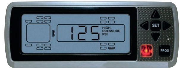
HIGH PRESSURE ALARM