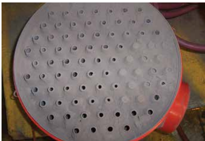
Figure 4- Strata- tube / Venturi Precleaner- Blocked