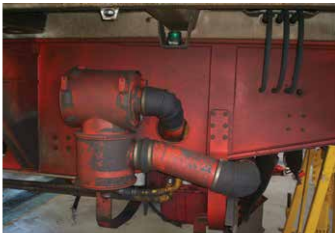
Figure 3- Radial Housing Filter System with Ejection Port

It is interesting to note that traditional practice when a Radial Filter Element becomes loaded is to stop the machine and “blow- out” the Filter Element. This practice not only interrupts productivity and inflicts labour costs but exposes the worker to Airborne Particulate / Fibre that can compromise the Filter Media, resulting in failed Engine and Components.