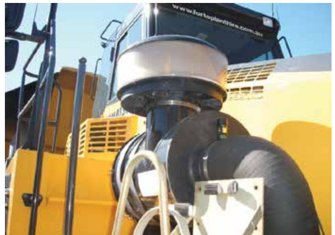
Figure 2- Dust Bowl- Digestive Air Intake System

Contaminated engine intake air enters the Bowl where heavier than air Particulate was collected inside the Bowl Housing.