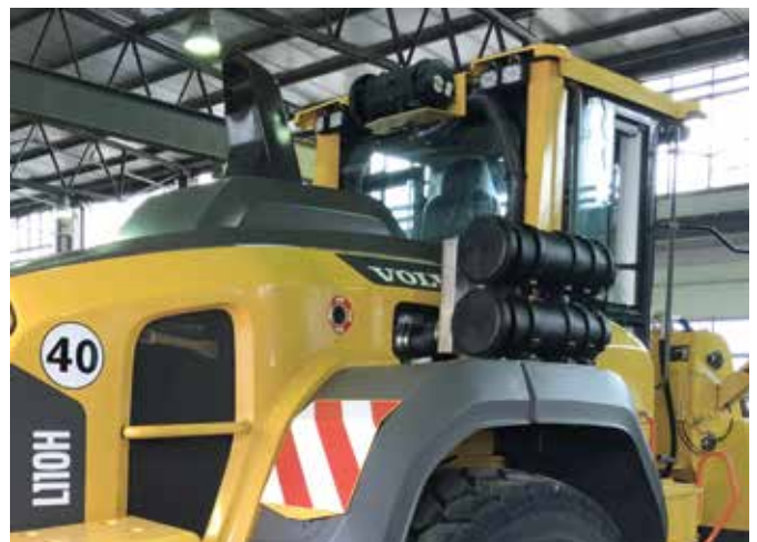
Figure 7- Dual XLR® System on Volvo L110H