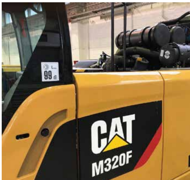
Figure 9- Dual XLR® System on CAT M320F Excavator- with RESPA CF2 for Cabin