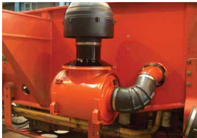
Figure 5- Radial Housing modified with attached Precleaner

Ejective Centrifugal Precleaners are very efficient (>85%). However, the efficiency can also be dramatically reduced as the Filter Element becomes loaded, air flow restriction increases which in turn reduces suction draw from the Precleaner (the Ejection Impeller slows down).