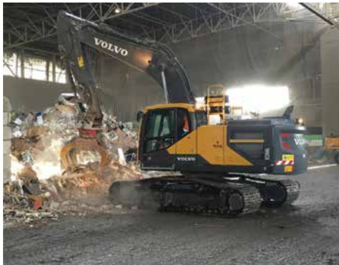
Figure 8- Dual XLR® System on Volvo EC250