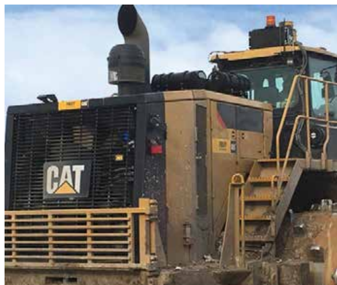
Figure 10- Triple XLR® System on CAT 836K Compacter