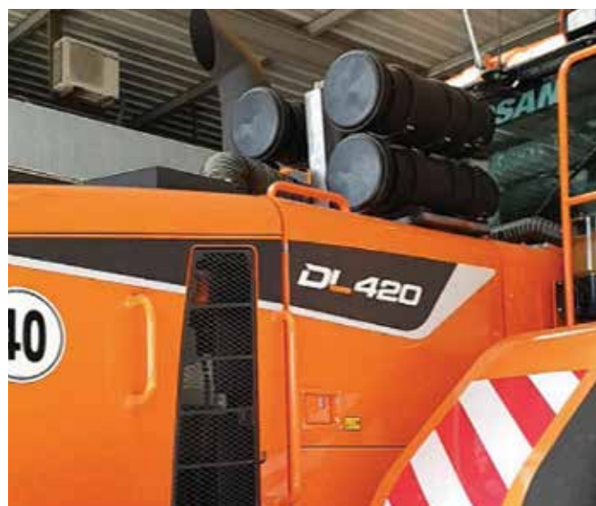
Figure 11- Triple XLR® System on Doosan DL420 WLoader