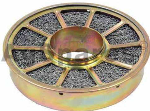
Figure 1- Typical simple design Digestive Oil Bath Filter

This type of Engine Air Intake technology- whilst better than using nothing- evolved quite rapidly.