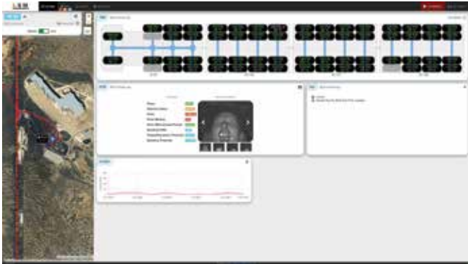
Figure 12- FSM- Fleet Safety Tracking / Maintenance On- line System