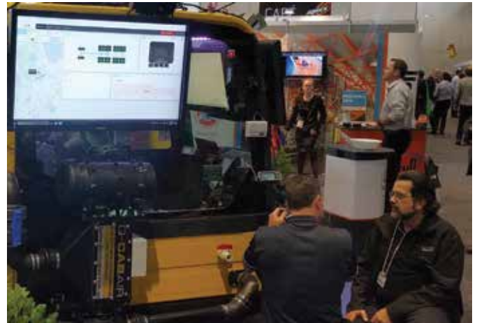
Figure 13- Demonstration Cabin / Simulator