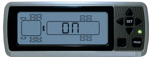
SYSTEM ON AND MONITORING

Triggers a "HOT" wheel over temperature alert >80°C.