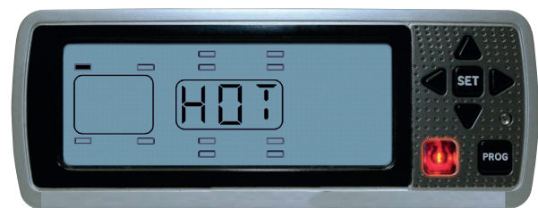
HIGH TEMPERATURE ALERT