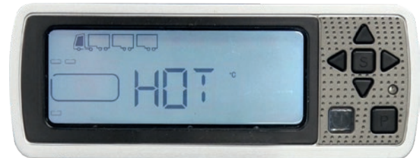
HIGH TEMPERATURE ALARM