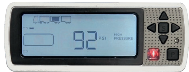
HIGH PRESSURE ALARM