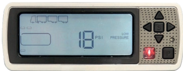
LOW PRESSURE ALARM

Easy to install, with full instructional documentation and detailed engineering drawings available.