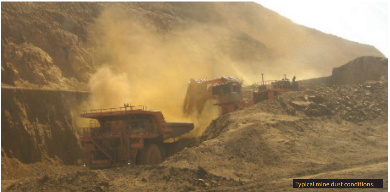
Typical mine dust conditions.