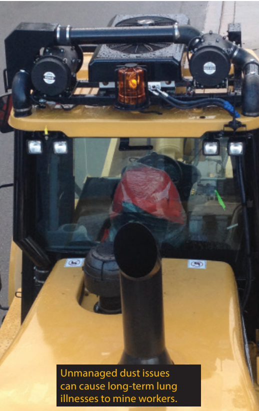
Unmanaged dust issues can cause long-term lung illnesses to mine workers.

health and safety to best protect the occupants of enclosed cabins, there are other cost benefits of a reliable and complaint cabin pressuriser and filtration system that are often easily forgotten,” Woodford explains.