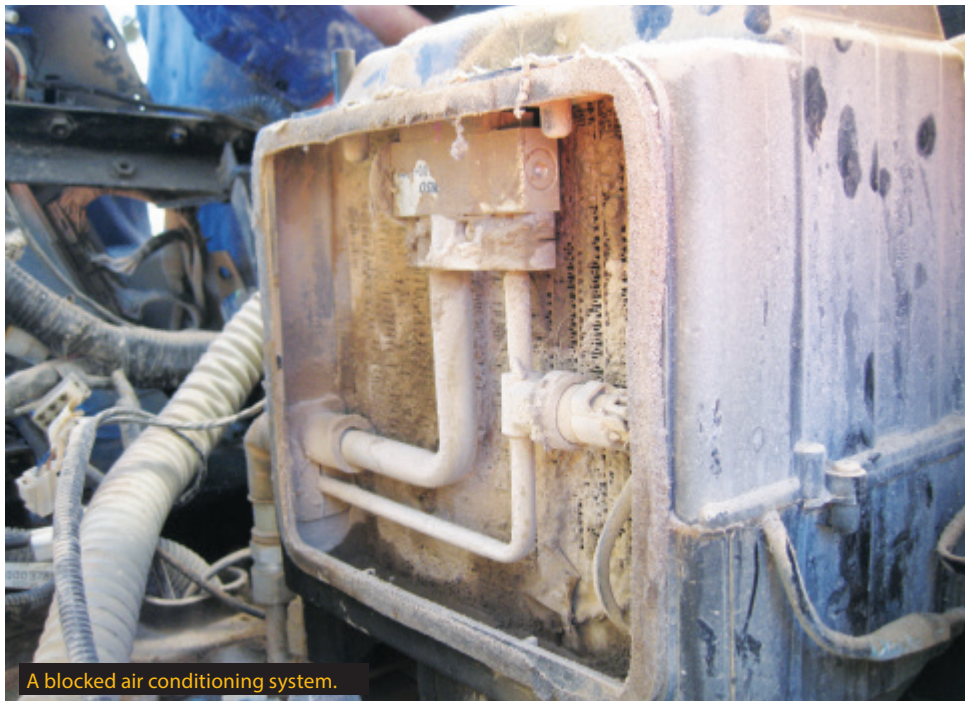
A blocked air conditioning system.