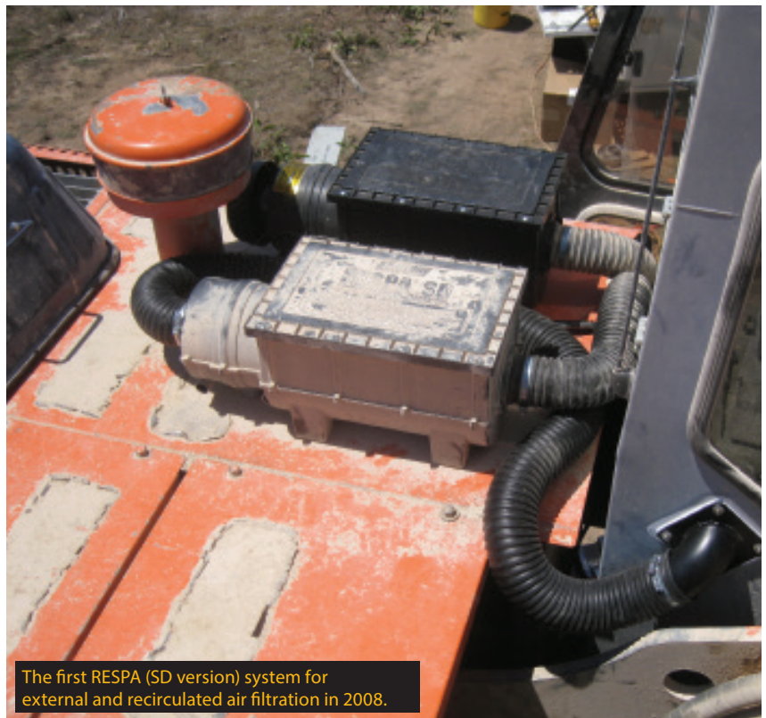
The first RESPA (SD version) system for external and recirculated air filtration in 2008.

"What ISO 23875 will mean if it becomes a standard is that all persons conducting a business or undertaking (PCBUs) such as suppliers of mitigation technologies, the machine provider and the operators will all be responsible under the workplace health and safety act (Work, Health and Safety Act 2011), so they are totally accountable for the lung health